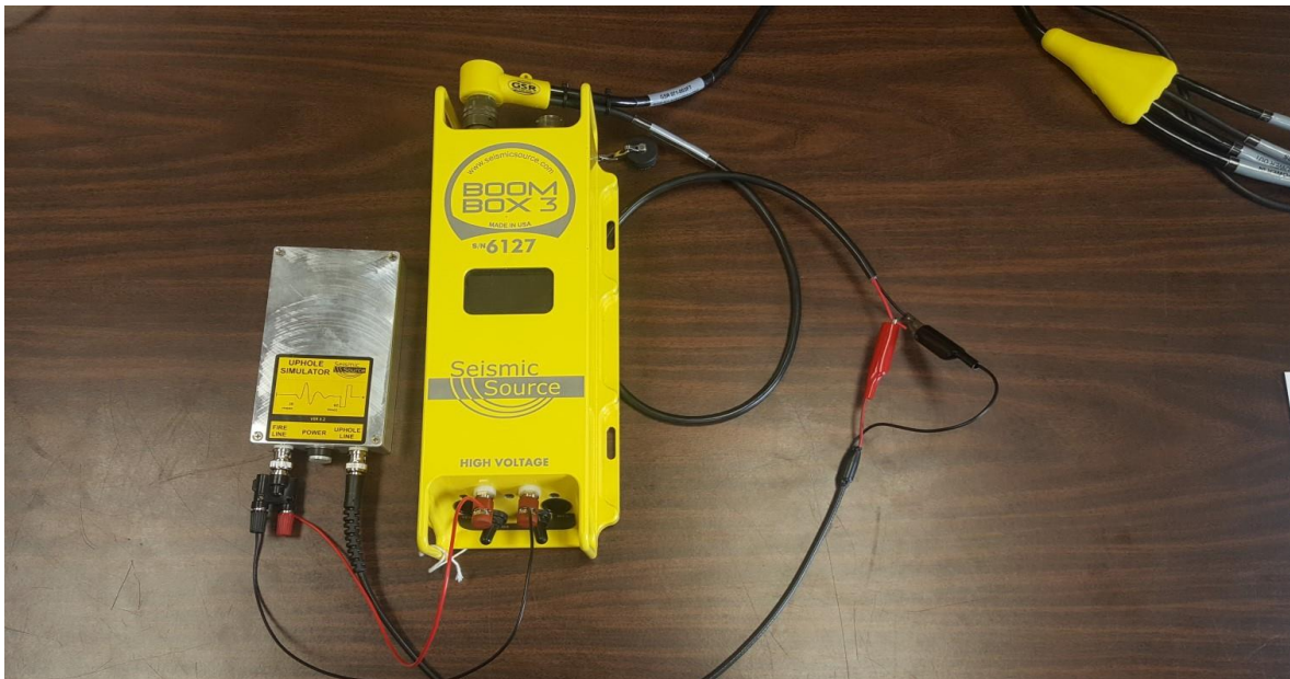
Uphole Simulator connected to Boom Box 3