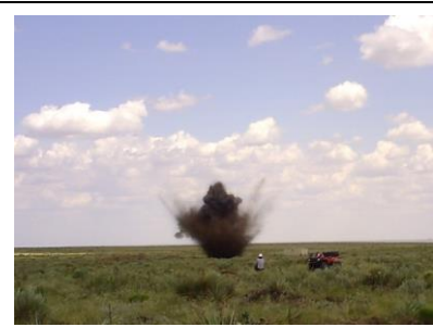
Save time and data