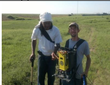
Test in the Field